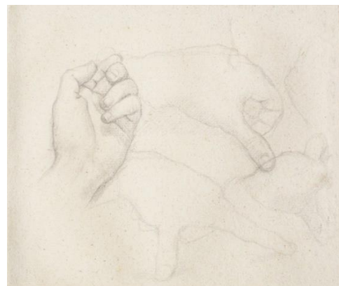
Edgar Degas (French, 1834–1917), Five Studies of a Hand , 1856. Graphite on paper, 5 1/8 x 6 in. Collection of Herbert and Carol Diamond