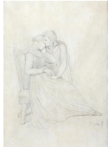
Jean-Auguste-Dominique Ingres (French, 1780–1867), A Couple Embracing , c. 1813–14. Graphite on paper, 6 5/16 x 4 13/16 in. Collection of Herbert and Carol Diamond