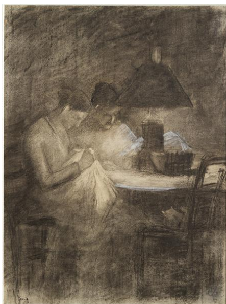
Charles Angrand (French, 1854–1926), The Seamstresses , c. 1880. Black Conté crayon with white heightening on paper, 23 1/2 x 17 7/8 in. Collection of Herbert and Carol Diamond