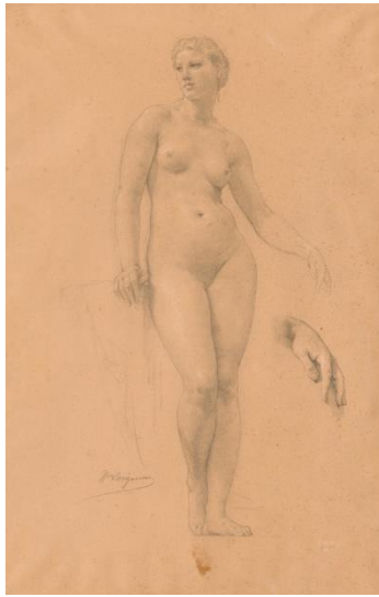
William-Adolphe Bouguereau (French, 1825–1905), Study of Venus for Apollo and the Muses in Olympus , c. 1867. Graphite with touches of white chalk on paper, 18 7/16 x 12 in. Clark Art Institute, 1955.1578