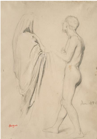
Edgar Degas (French, 1834–1917), Study for Dante and Virgil , c. 1856–57. Graphite with white chalk on grayish paper, 12 1/8 x 8 7/8 in. Clark Art Institute, 1955.1403