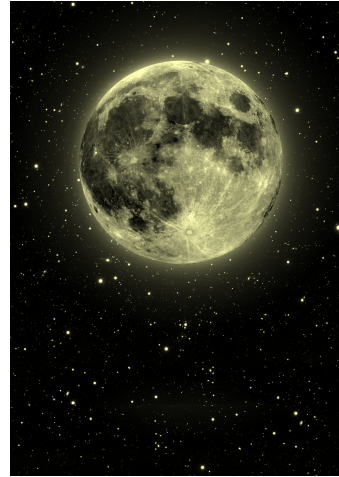
The Moon

Look at this photograph of the moon. The moon is circular, textured, and shines in the night sky, reflecting sunlight onto the Earth. Now look at Arthur Dove’s painting Moon from 1935, and see how the artist has used colors, light, and shadows to make a painting ABOUT the moon, rather than a picture OF it.