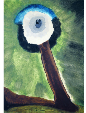
Moon , 1935, by Arthur Dove (National Gallery of Art, Washington, D.C. Collection of Barney A. Ebsworth; Courtesy of and copyright The Estate of Arthur Dove/Courtesy Terry Dintenfass, Inc.)

The real moon is connected to the Earth by an invisible force called gravity. How has Arthur Dove suggested this connection?