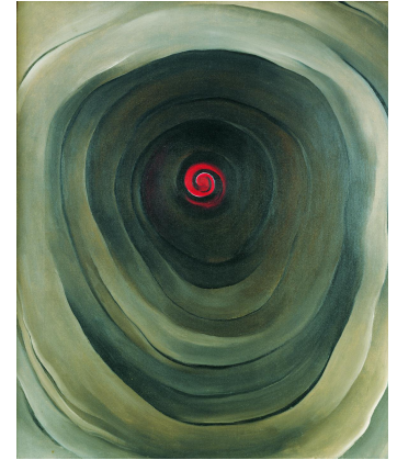
A Piece of Wood II , 1942, by Georgia O'Keeffe (The Shey Collection. Through the Harn Museum, Gainesville, Florida)

How is this painting ABOUT a piece of wood rather than a picture OF a piece of wood?